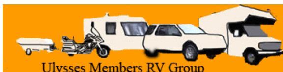
Ulysses Members RV Group

Mobile: 0412 942 466 E-mail: mflinders@netspace.net.au