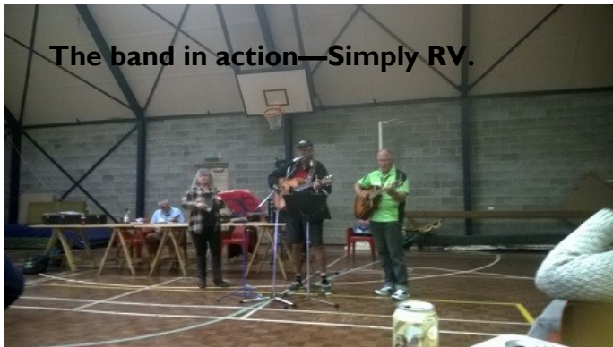
The band in action—Simply RV.