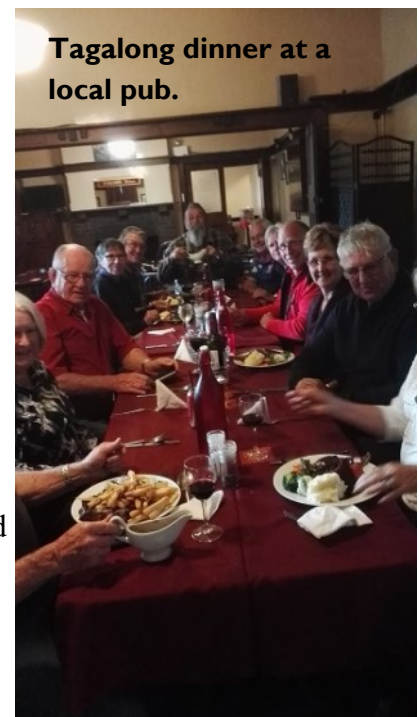
Tagalong dinner at a local pub.