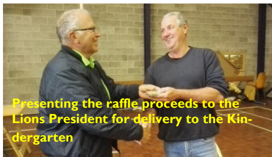
Presenting the raffle proceeds to the Lions President for delivery to the Kin- dergarten