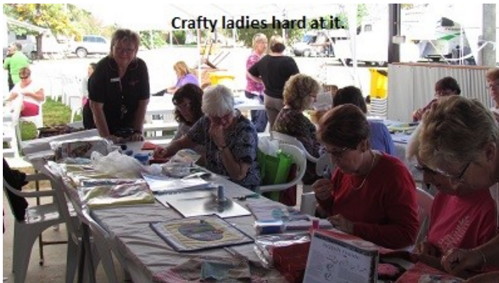
Crafty ladies hard at it.