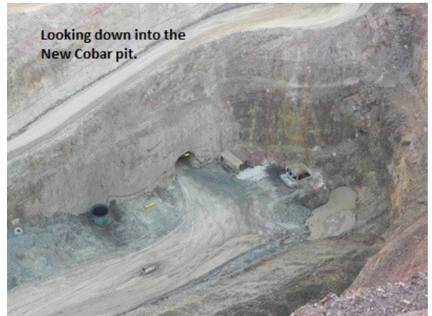
Looking down into the New Cobar pit.

Now we can look forward to plenty of rallies next year as the State coordinators get their calendars organised, as well as our 9 th AGM at Mallacoota Foreshore Caravan Park from October 17 th to 23 rd 2015. Information on next years AGM can be found further in this newsletter.