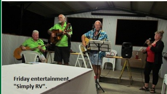
Friday entertainment, "Simply RV".

Friday morning breakfast was catered by the caravan park management team, and for $5 a head we had our fill of pancakes, strawberries and cream or syrup as well as coffee and tea.