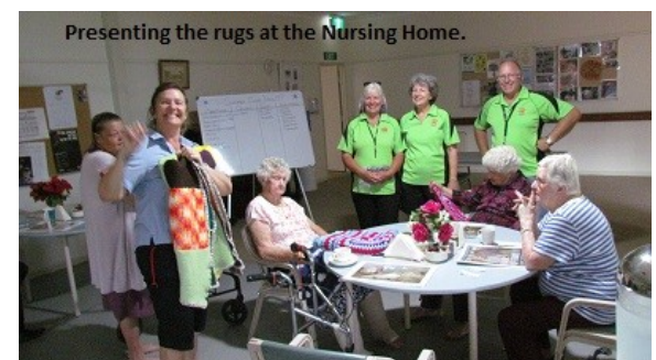
Presenting the rugs at the Nursing Home.