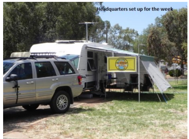
Headquarters set up for the week