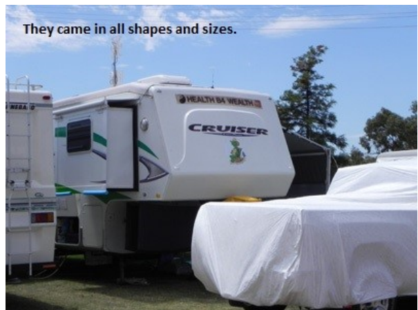
They came in all shapes and sizes.